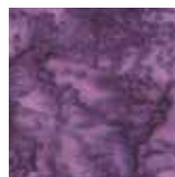
1895 46-Plum 1/4 Yard