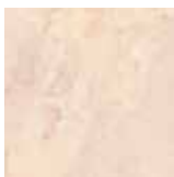
1895 501-Sand Dollar 1/4 Yard