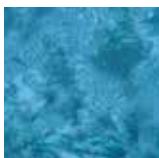
1895 311-Lake 1/8 Yard