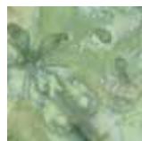
1895 227-Sprout 1/4 Yard