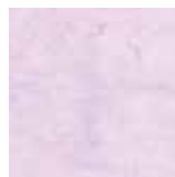
1895 30-Lilac 1/4 Yard