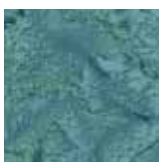
1895 538-Nirvana 1/4 Yard