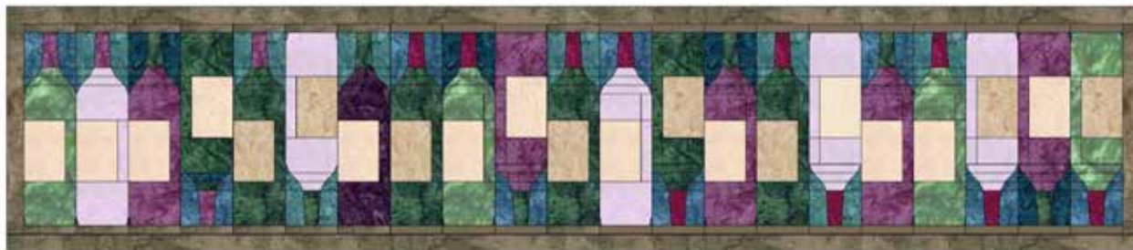
Table runner finishes at 65" x 14"

Press, then add batting and backing and quilt as desired. Attach binding.