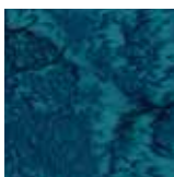
1895 239-Persia 1/8 Yard