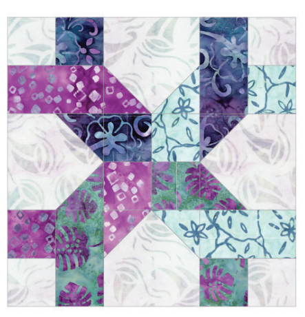
Make 1 12-1/2" square

6. Sew the blocks together in five rows of four blocks each. Press the rows in opposite directions. Sew row to row and press the quilt top in one direction.