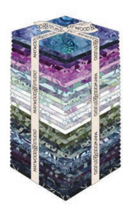
FQ-MASCOG or 27 Fat Quarters

NOTE: This pattern requires 27 Fat Quarters: 7 light and 20 dark. The Coastal Getaway Batiks Fat Quarter Bundle has 33 pieces total.